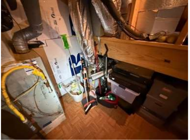
Stored items in the garage.