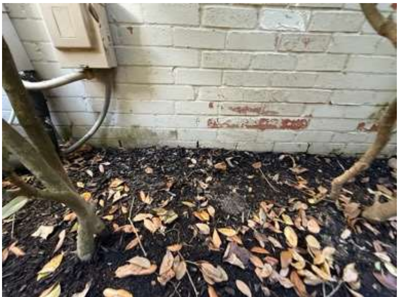
Heavy foliage should be trimmed back from structure.