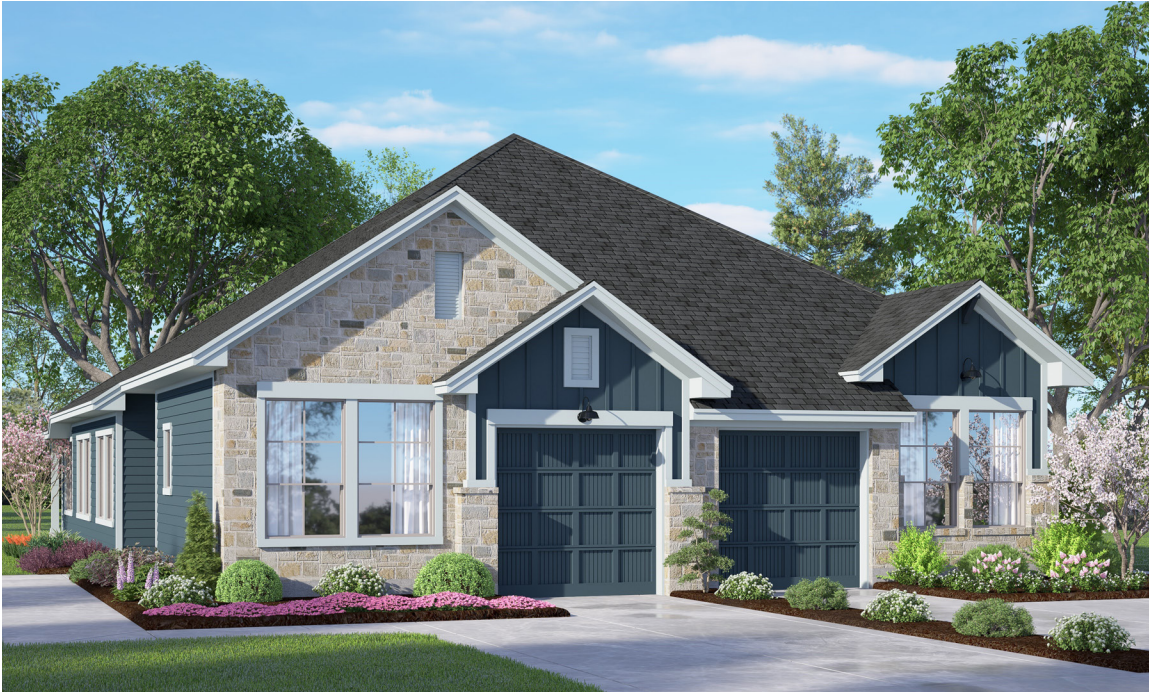
elevation A - Chalet