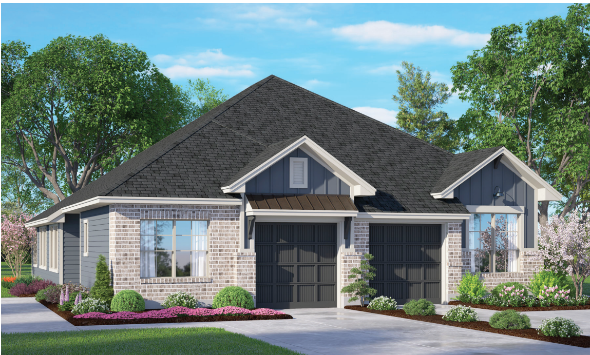
elevation C - Chalet