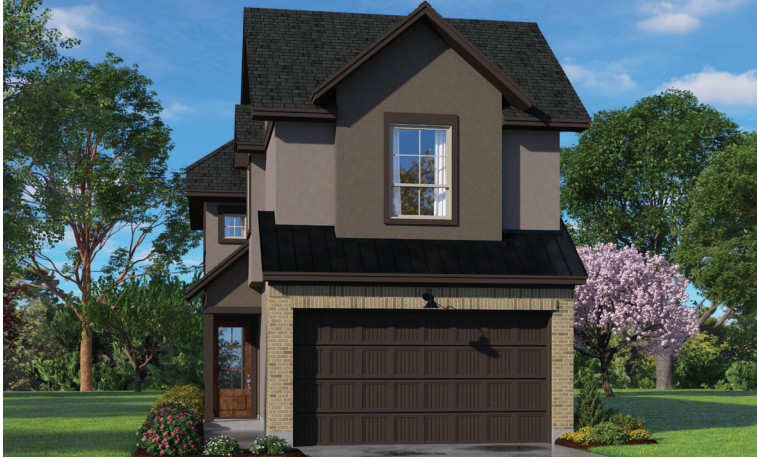
elevation A - stucco

CHANTILLY II | plan 7290 - approx. 1,866 sqft