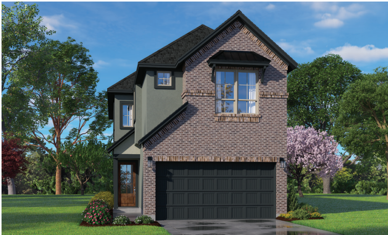
elevation B - stucco