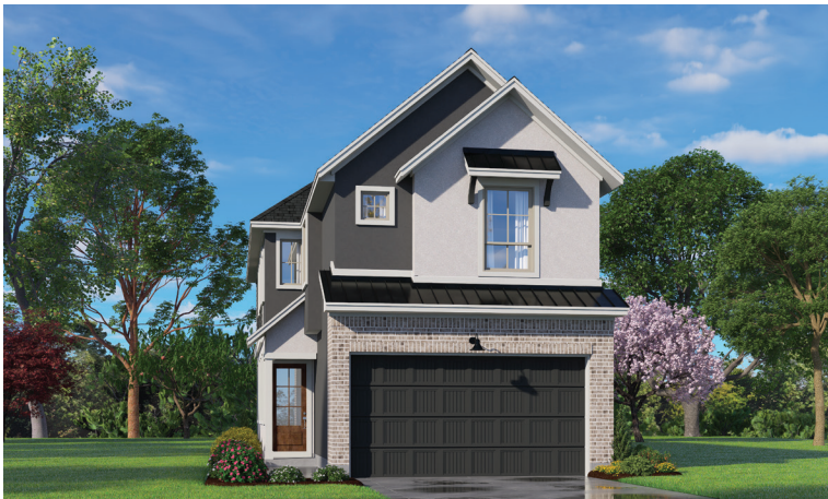
elevation C - stucco

Availability of elevation options may vary by community, please ask your New Home Consultant for details on the current offerings in the community you are considering. Square footage and room dimensions are approximate and may vary per elevation. Window placement, roof line and porches may also vary by elevation. Plans, features, prices, and availability are subject to change without notice. Print date: 6-19-24