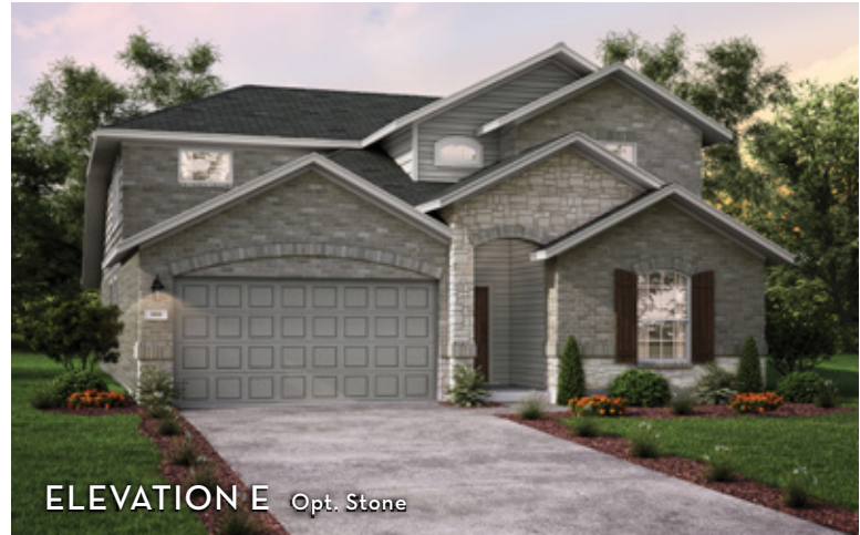
ELEVATION E Opt. Stone