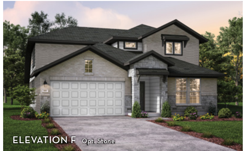
ELEVATION F Opt. Stone