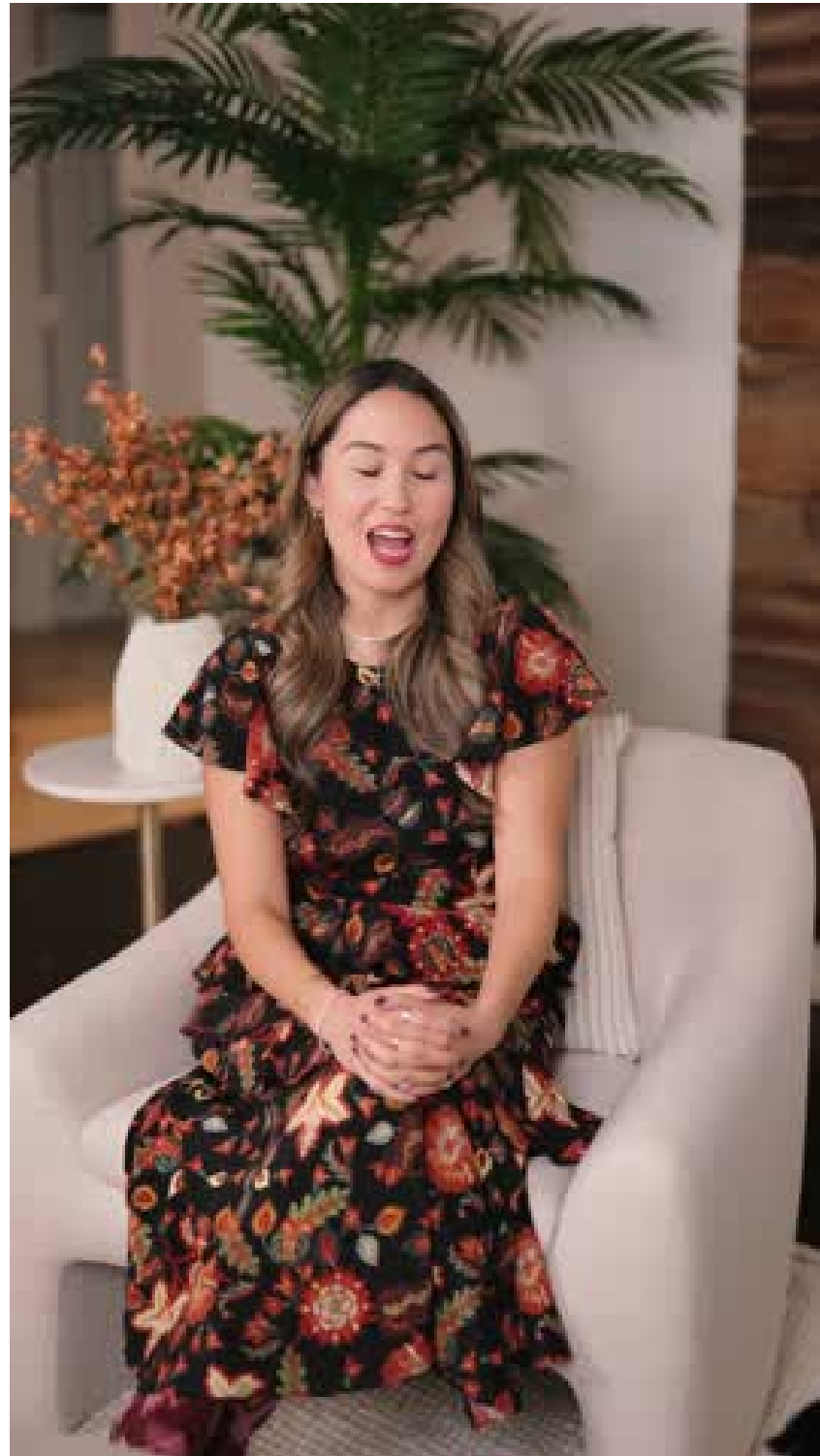
Click for video