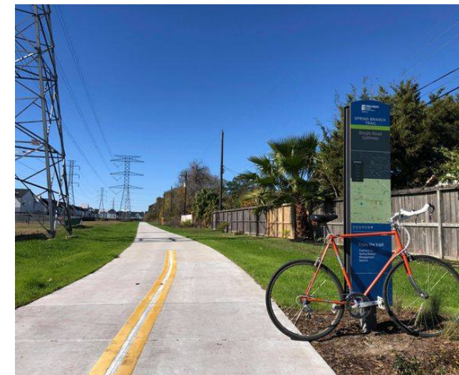
Steps from the Spring Branch Trail and Dog Park, one of Houston's newest projects