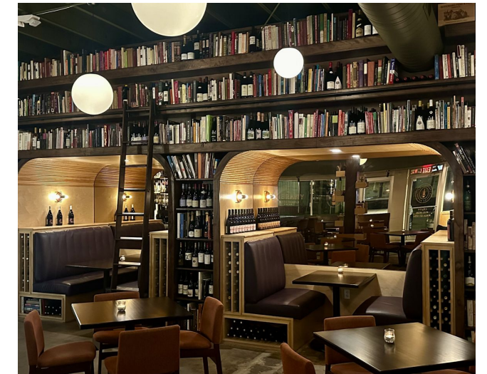
Enjoy the new retail and restaurants along Longpoint, shown above and below