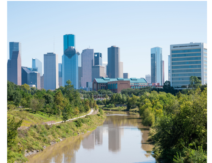
Spring Branch is conveniently located 15 minutes from downtown Houston