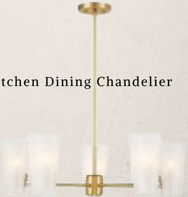
Kitchen Dining Chandelier