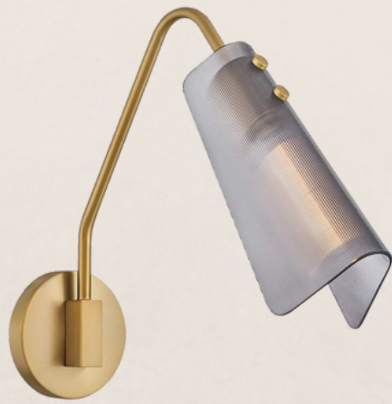
Office Light Fixtures