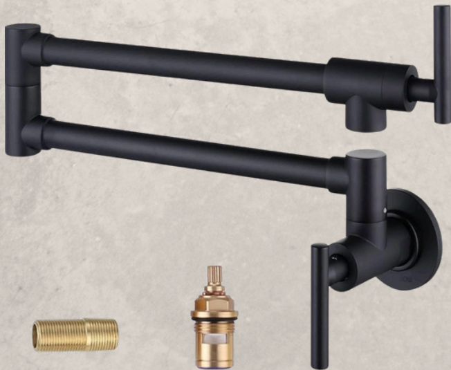
Kitchen Pot Filler