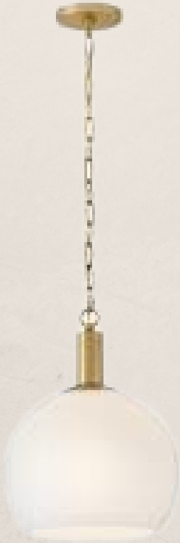
Kitchen Island Pendant