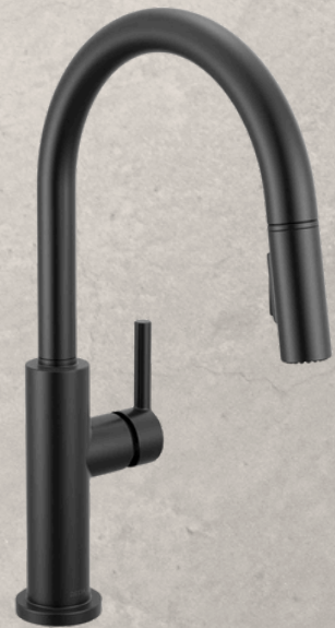
Kitchen Sink Faucet